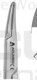
Crile Wood Curved - 15cm ASR-14CTC