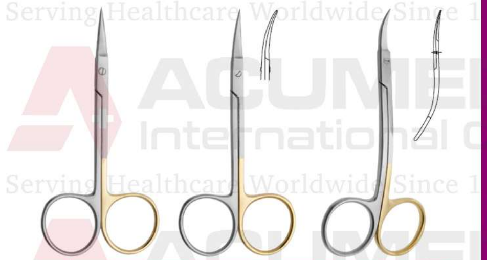
Iris Scissor Straight - 11.5cm ASR-44