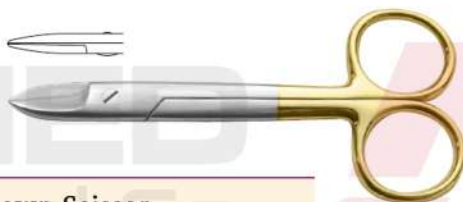
Crown Scissor Straight 11.5cm ASR-36TC