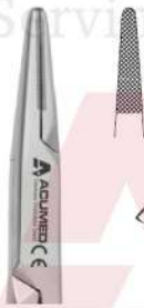
Crile Wood Straight - 15cm ASR-14TC