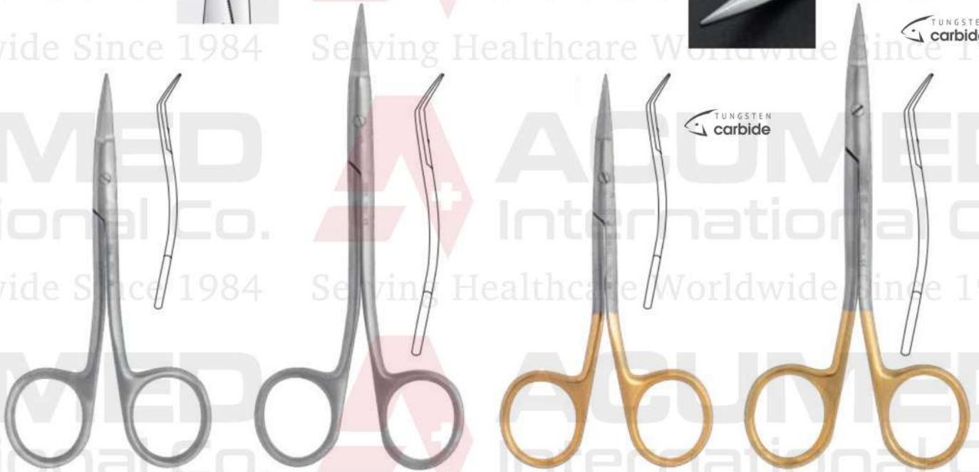
Zed Scissor S-Curved - 11.5cm ASR-38