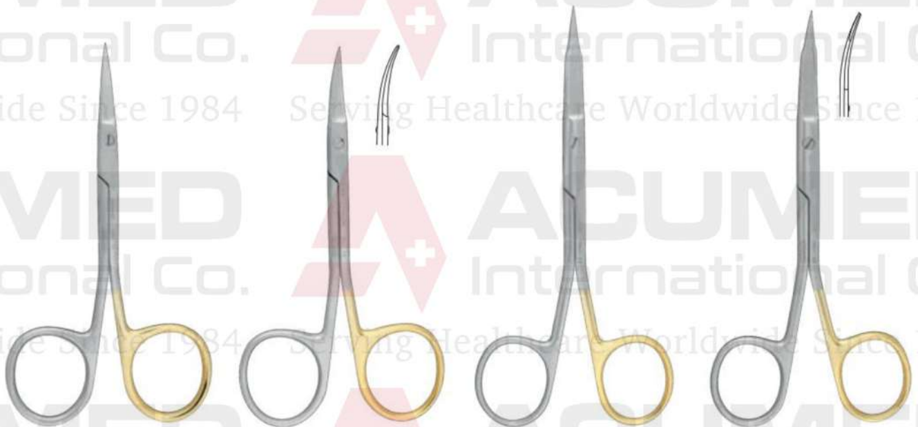
Iris Scissor Straight - 11.5cm ASR-40