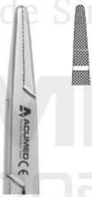
Crile Wood Straight - 15cm ASR-14