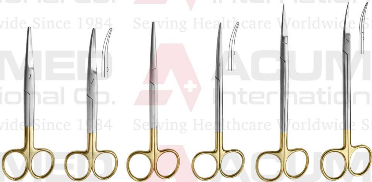
Mayo Straight - 14cm ASR-30TC Mayo Curved - 14cm ASR-31TC Metzenbaum Straight - 14.5cm ASR-32TC Metzenbaum Curved- 14.5cm ASR-33TC Kelly Straight- 16cm ASR-34TC Kelly Curved- 16cm ASR-35TC