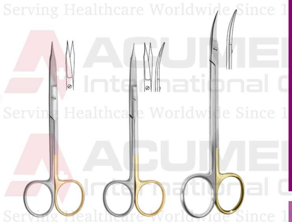
Goldman Fox Straight - 13cm ASR-47