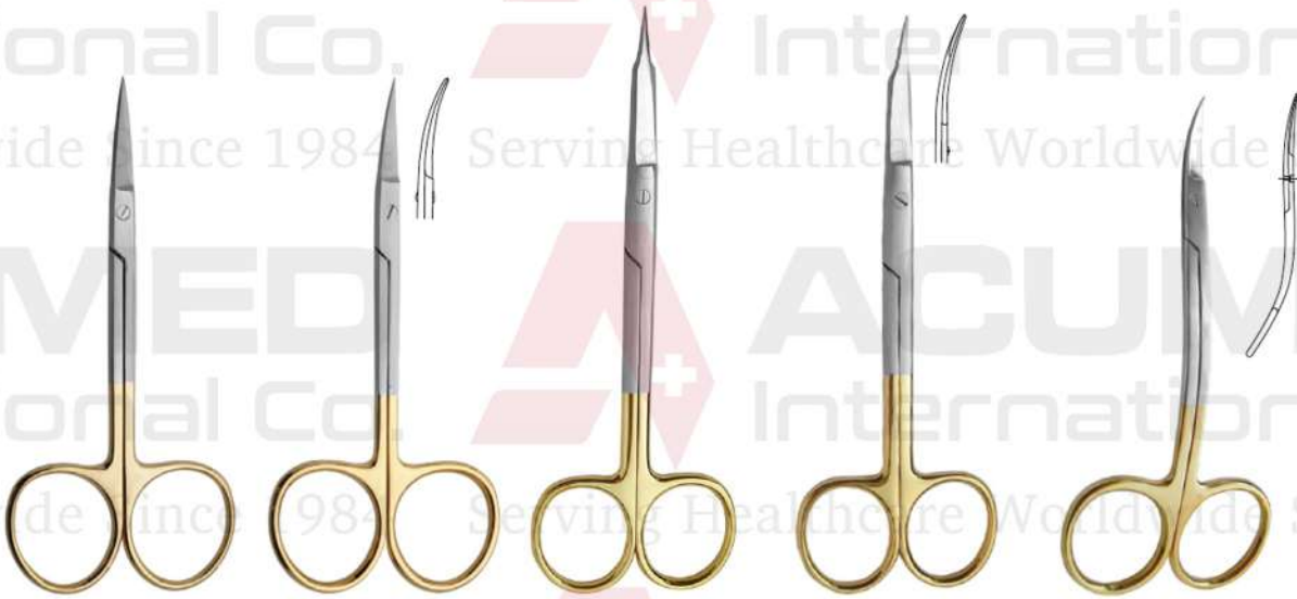
Iris Scissor Straight - 11.5cm ASR-25TC Iris Scissor Curved - 11.5cm ASR-26TC Goldman Fox Straight - 13cm ASR-27TC Goldman Fox Curved- 13cm ASR-28TC La-Grange S-Curved- 11.5cm ASR-29TC