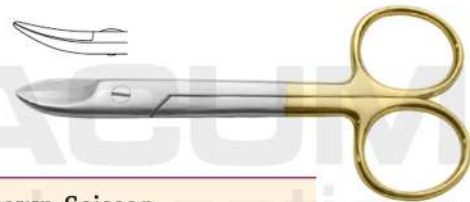
Crown Scissor Curved- 11.5cm ASR-37TC